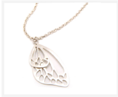
MINI BLING WING NECKLACE wings measure 1.5" drop 16" chain including clasp

Every wing segment is hand cut with a jeweler's saw from sterling silver sheet. No two wings will ever be exactly the same.