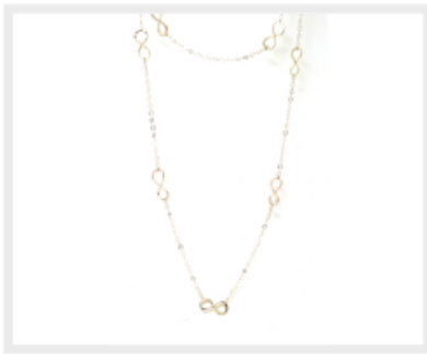
FOREVER NECKLACE 44" chain including infinities 13 infinity symbols in each necklace

Each infinity symbol is hand fabricated from 14 guage wire and hammered.