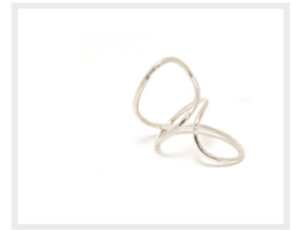
FOREVER RING adjustable to fit any size