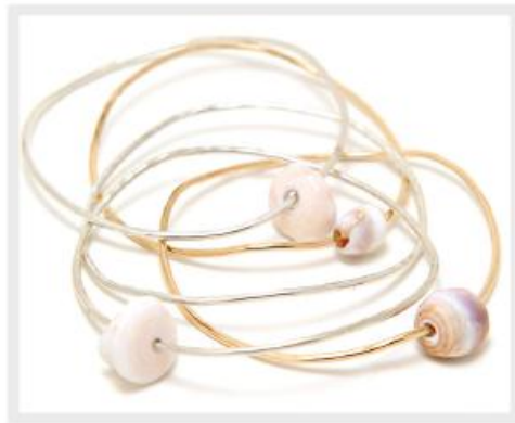
BANGLES available with or without shells