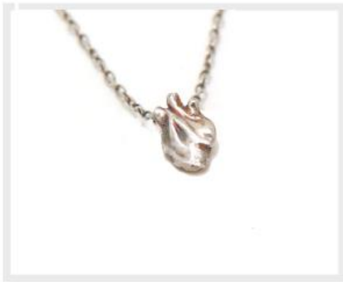
HEART OF GOLD

Each piece is cast from handcarved wax sculptures. Each piece is cast solid with reclaimed sterling silver or gold.