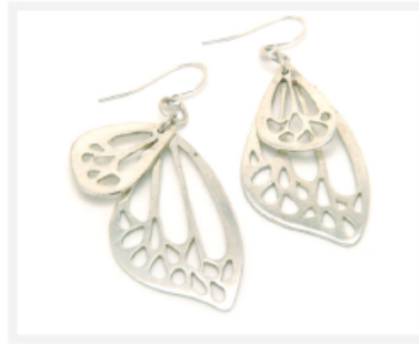
BLING WING EARRINGS 1.5" drop