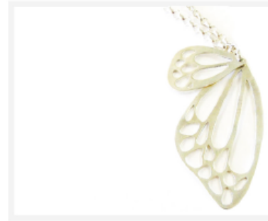
BLING WING NECKLACE wings measure 2" drop 24" heavy chain including clasp