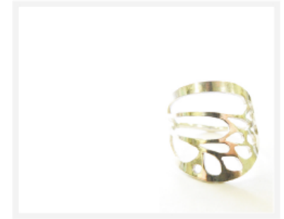
WING RING available sizes 5-9