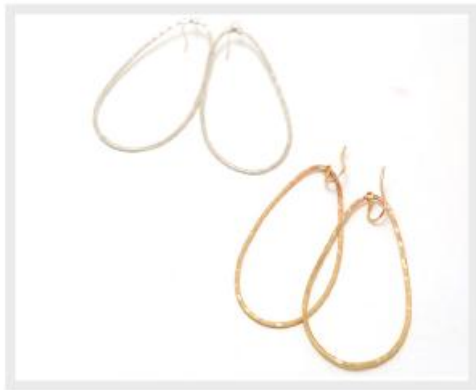
DEW DROP EARRINGS

Each piece is fabricated from 14 gauge wire and hammered on a Ti leaf stalk, the organic mandrel creates the movement in each piece.