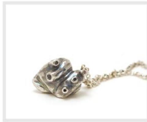
FOLLOWING MY HEART