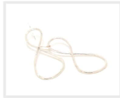
FOREVER EARRINGS 2" drop