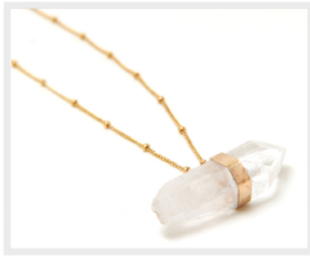
NECKLACE 18" chain

Each piece is set into a hand-fabricated casing. Each casing is made to fit each individual crystal. All crystals are naturally occurring and no two look the same.