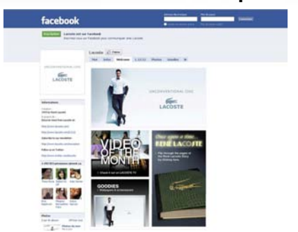
LACOSTE Facebook Page