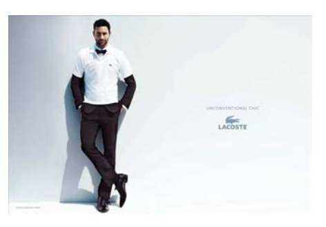
« Unconventional Chic » Concept

In October, LACOSTE announces the third Save Your Logo project in Anhui province, China. The project supports the release and breeding of the Chinese Alligator, Alligator Sinensis, which is threatened by extinction due to its receding habitat in the natural wetlands.