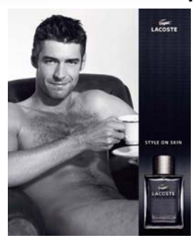
Press advertising "Lacoste Pour Homme"