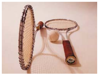
First steel tennis racket, 1963