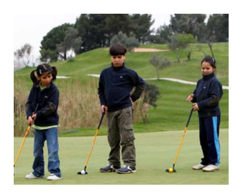
INSERGOLF project in Barcelona

For Spring/Summer, Zaha Hadid designs for LACOSTE a special footwear capsule collection. The LACOSTE footwear project began with a digitized version of the iconic crocodile logo. Hadid's research team used this as a basis to explore a series of surfaces with repeated patterns.