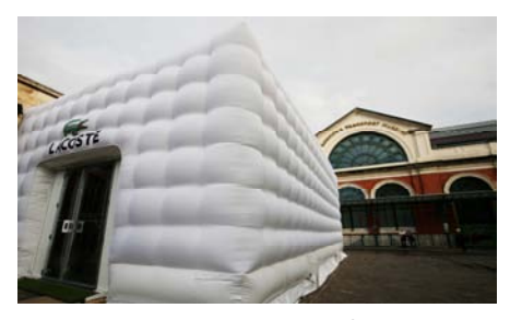
Lacoste at Covent Garden