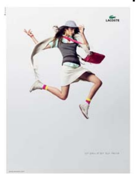
Lacoste new advertising campaign