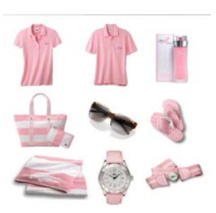
Pink Croc Collection