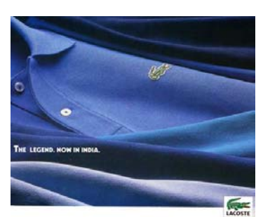
Lacoste in India

Presentation at the Paris Boat Show of the LACOSTE 42-foot yacht, designed by American architects "STEPHENS and SPARKMAN" and produced as a limited edition.