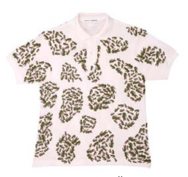
Frères Campanas's Collector's Serie