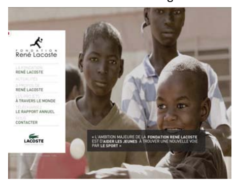
The René Lacoste Foundation Website