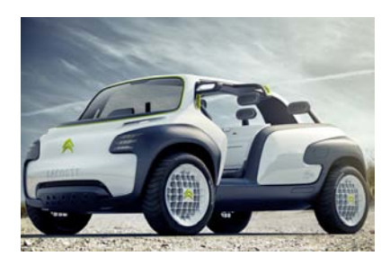
CITROEN LACOSTE- Concept Car

In June, the brand launches its e-shop in France created by LACOSTE, DEVANLAY and PENTLAND. With close to 3 000 references, this e-shop gives access to the brand's universe: apparel, footwear, eyewear, leather goods, watches, home textile and fragrances. By August, the e-commerce website becomes available in the U.K and Germany.