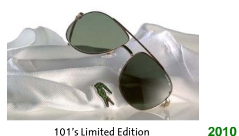
101's Limited Edition