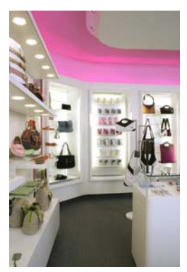
International accessories travel retail concept strore