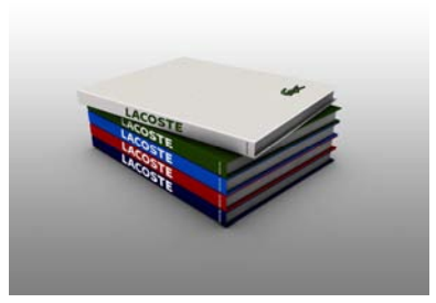
« The Element of Style » by Assouline Editions